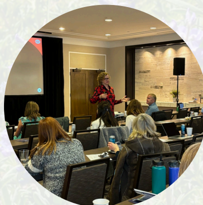
April 2024 Membership Meeting