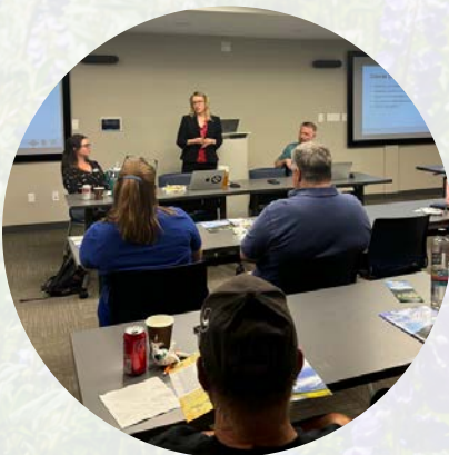
Vail Pro® Wildfire/ REALFIRE®

Stay tuned for more classes, events and networking opportunities! And visit members.vbr.net/classes-and-events-calendar .