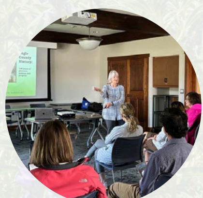
Vail Pro® Eagle County History