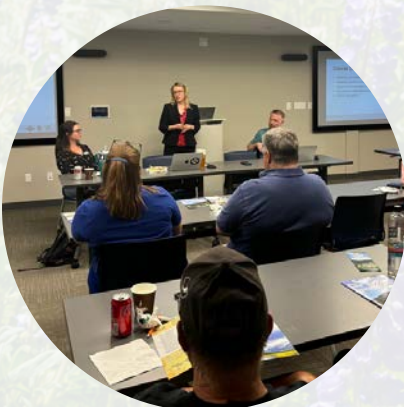
Vail Pro® Wildfire/ REALFIRE®

Stay tuned for more classes, events and networking opportunities! And visit members.vbr.net/classes-and-events-calendar .